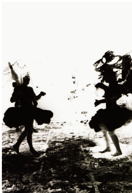
From the Series -Parcours humain-

Zürich Switzerland www.martina-villiger.ch